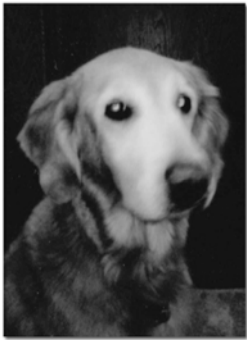
Pet Therapy Dog Kobi

It was 1990 when Actors and Others began its Pet Assisted Therapy Program with only one hospital and one team. While many health workers recognized the benefits of such a program, others couldn’t see past the unproven notion that animals in their facilities would t r a n s m i t c o m m u n i c a b l e disease. Fast forward to 2008 where such